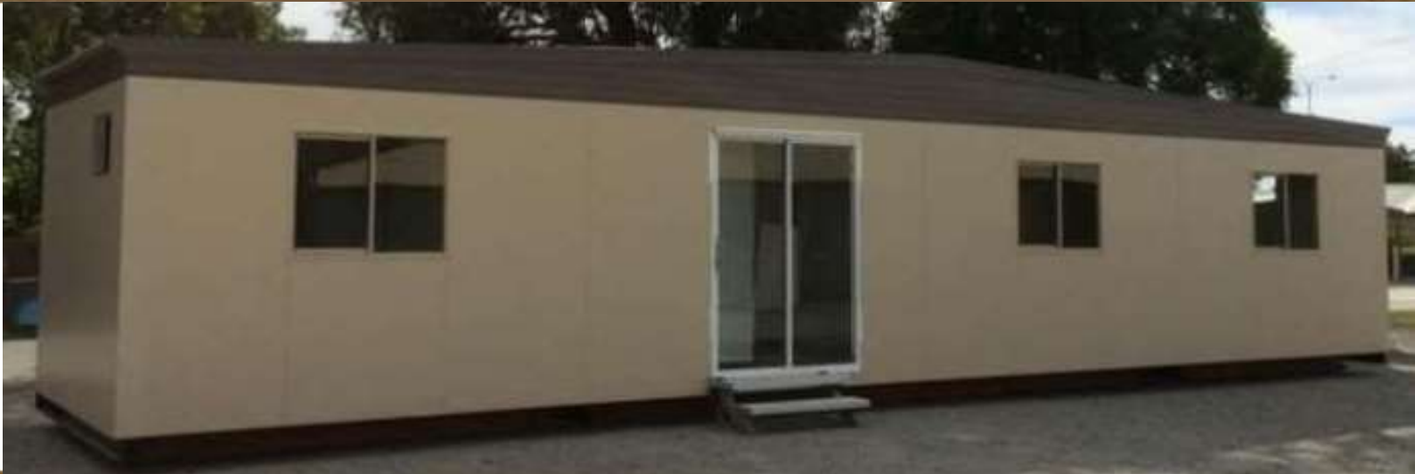
Refurbished Portable Cabin 14.4m x 3.0m